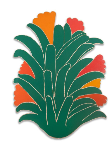
Santídio Pereira, Objeto III, 2022 | Untitled, 2022 | Objeto XV, 2023.

The Museum of Modern Art of São Paulo will host, between April 2nd and September 1st, an unprecedented exhibition by the artist Santídio Pereira . With curatorship by Cauê Alves , chief curator at MAM, the exhibition Santídio Pereira: paisagens férteis [Santídio Pereira: fertile landscapes] brings together more than 30 works in the Paulo Figueiredo Room - some of them never before seen - including engravings, paintings and objects produced by the artist in a period between 2017 and 2024.